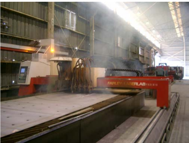
Before Farr Gold Series collector was installed - smoke from plasma cutting operation filled the facility.