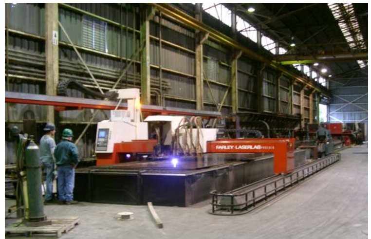
After Farr Gold Series collector was installed - plasma smoke is well controlled, maintaining clean operating conditions and ensuring worker safety.