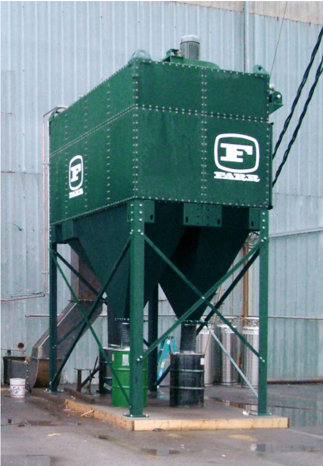
Farr Gold Series GS24 installed at Chatham Steel on a plasma cutting table application.