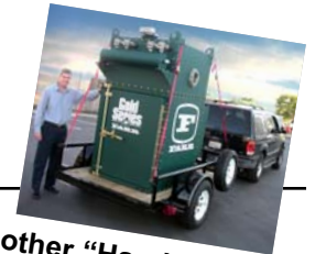
Another "Hands On" GS Demo Success Story!

Product: Farr APC HemiPleat™ Size: 16 Retrofit Cartridges to Fit Competitive Collector Application: Pharmaceutical Tablet Coater Customer: A Major Pharmaceutical Company Representative: Exfil Corporation